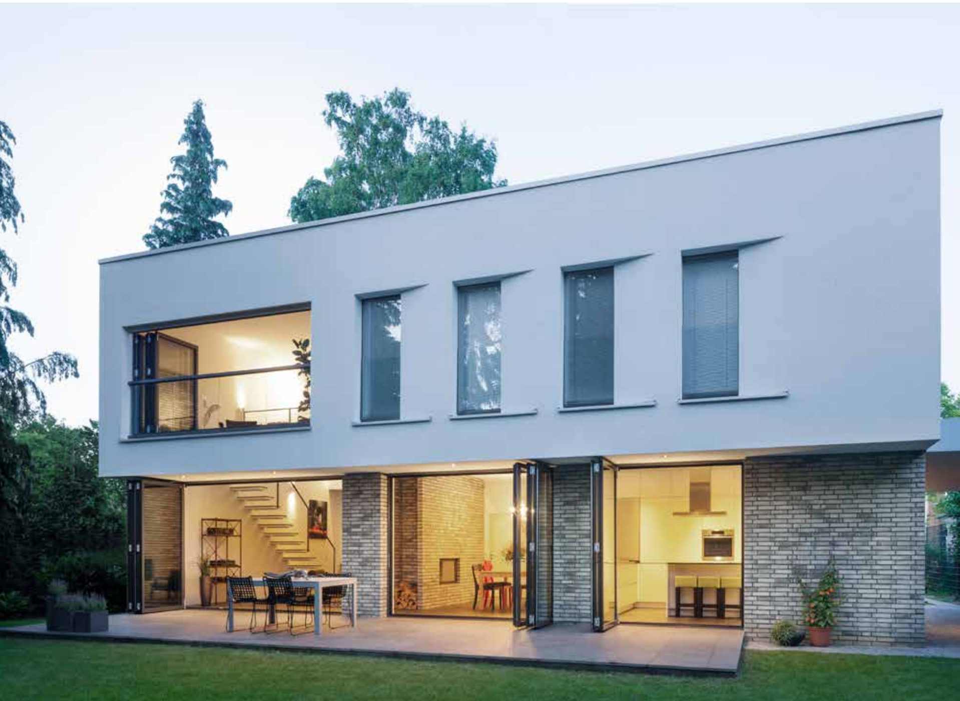
The alternative to traditional windows Hamburg, Germany