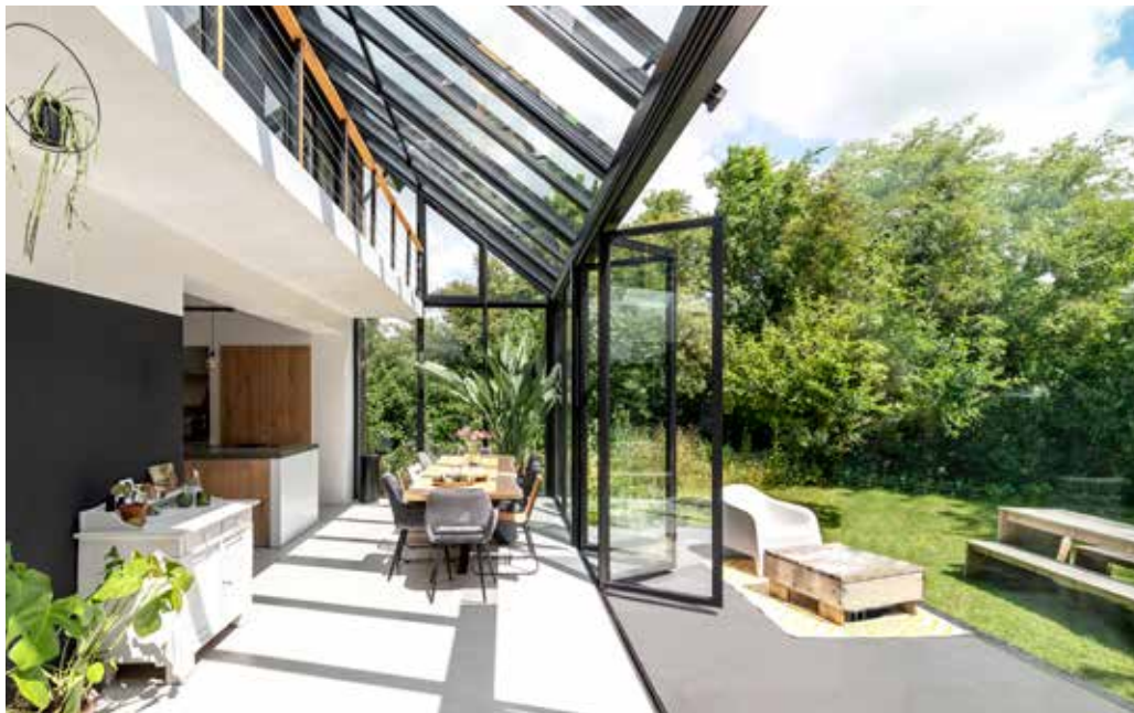
Bespoke solutions for the wintergarden · Frisia, Netherlands

The possibilities offered by a bi-folding door are almost limitless. It can be used as a substructure element for a wintergarden that can be opened across almost its entire width, as an entrance to a swimming pool, or used as an alternative to a traditional patio door or window. It is also suitable for public spaces, of course! Use it to build your shop entrance, glaze the VIP box in your stadium, or create a facade on your balustrade - whatever you're building, make the bi-folding door your first choice.