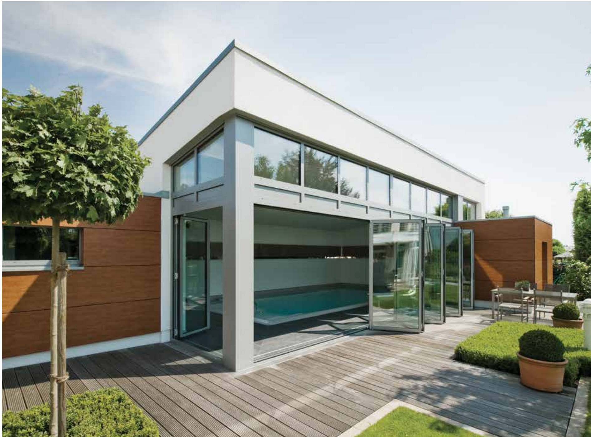
Bring air and light to your pool · Nottuln, Germany