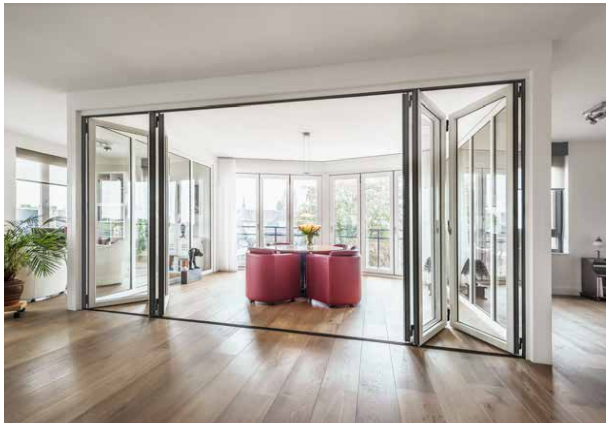
Flexible use of space - the bi-folding door as a partition · Best, Netherlands